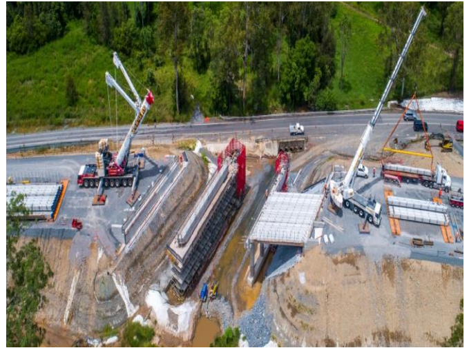
Norris Creek bridgeworks