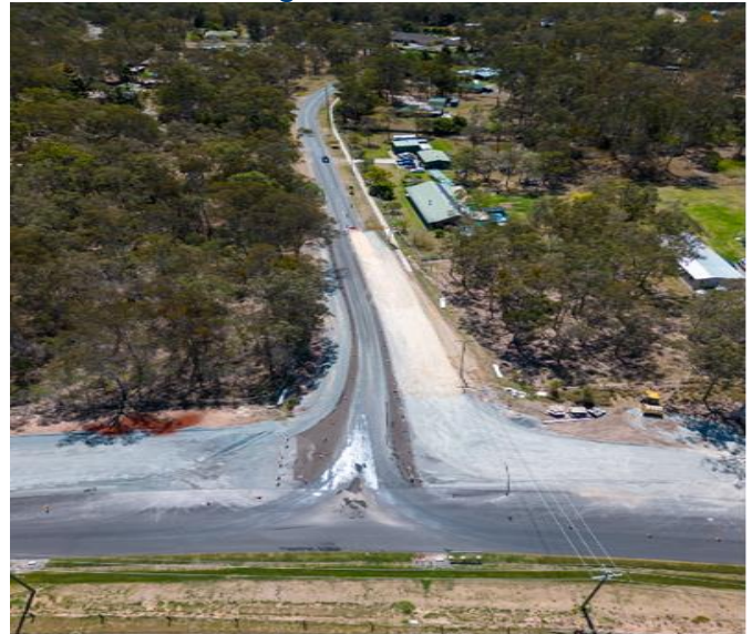
Kings Way intersection upgrade