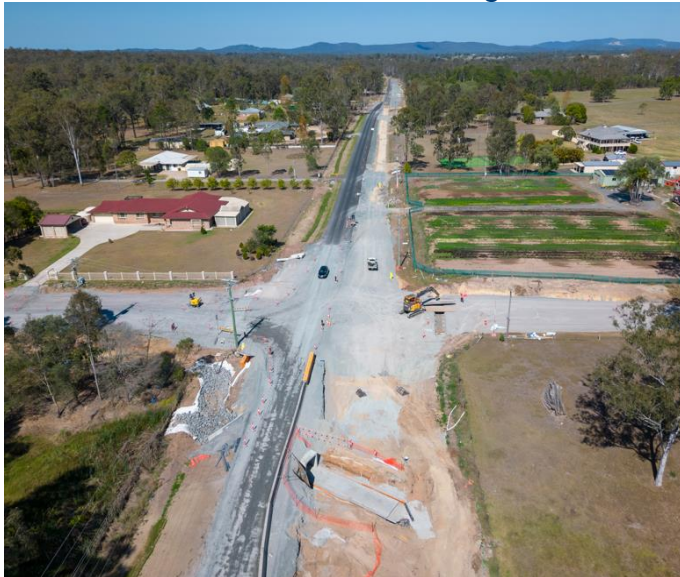
Norris Creek Road intersection upgrade