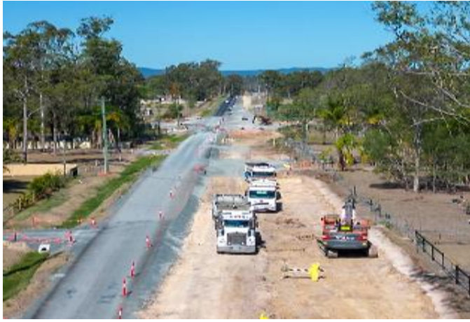
The old road and the new wide alignment