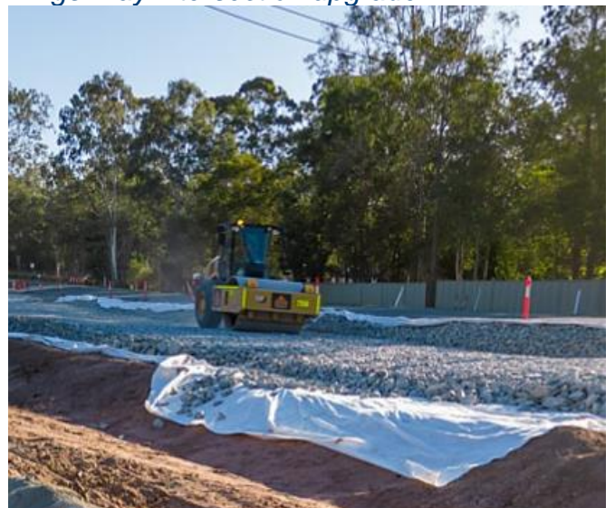
New rock foundations to improve stability in soft spots along the alignment