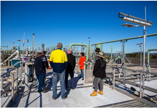
CRG members touring Cedar Grove Environmental Centre

A key task while master planning for the site includes considering options for community access to the Logan River for recreation purposes that align with the Logan River Accessibility and Connectivity Concept Plan (available on Council's website). Further information will become available as planning continues.