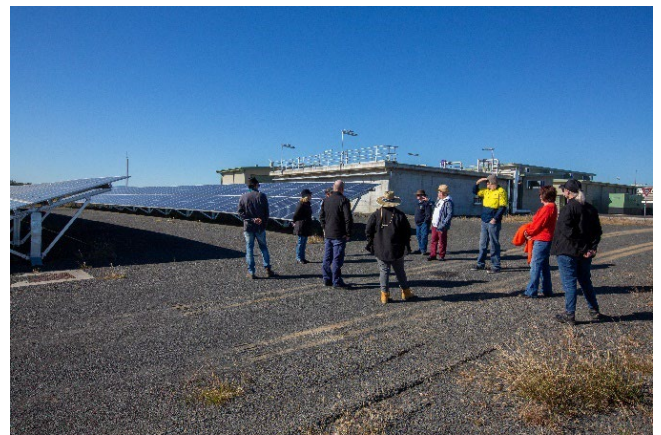
CRG site tour of the solar array at Cedar Grove Environmental Centre

You may see increased movements around the site in July 2023 as initial engineering investigations commence to support master planning activities.