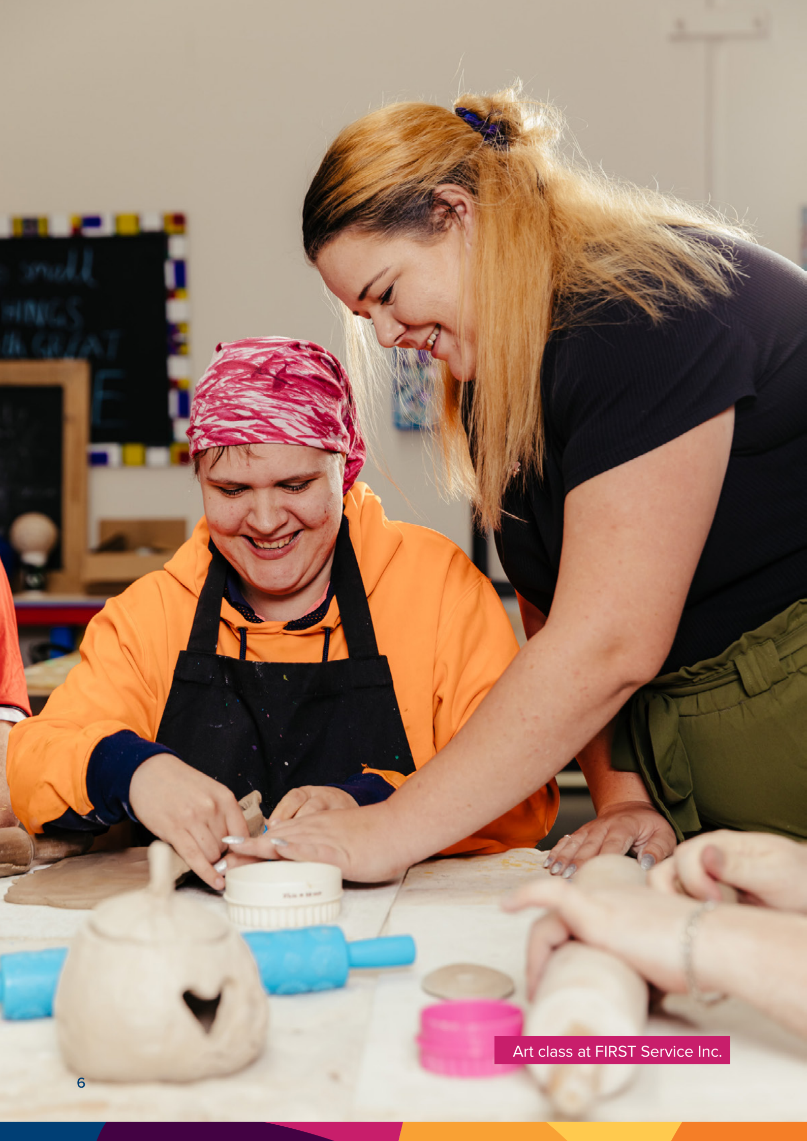
Art class at FIRST Service Inc.