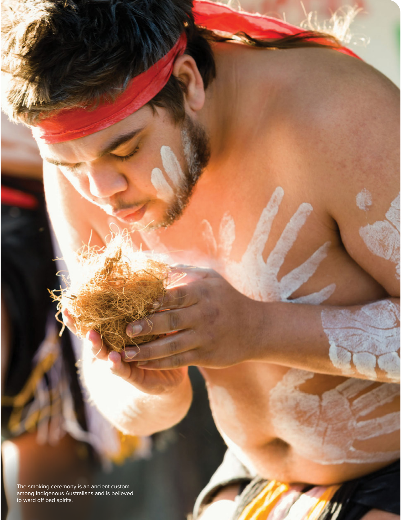
The smoking ceremony is an ancient custom among Indigenous Australians and is believed to ward off bad spirits.

Logan City Council acknowledges the Traditional Custodians of the land, pays respect to Elders past, present and emerging, and extends that respect to all Aboriginal and Torres Strait Islander peoples in the City of Logan.