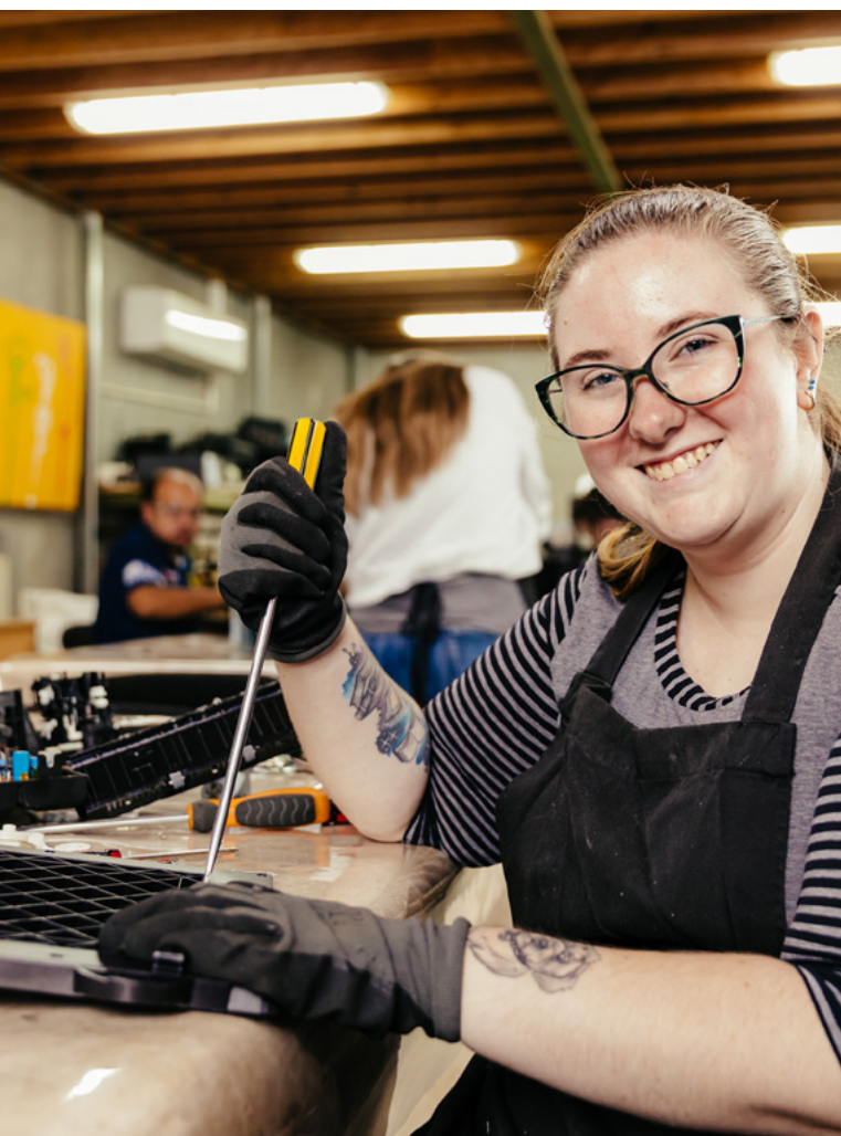
Substation 33 activity at FIRST Service.