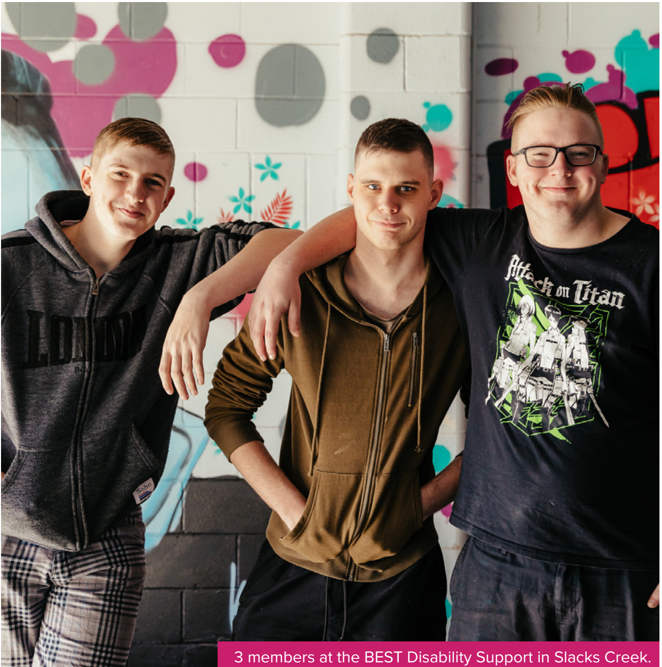
3 members at the BEST Disability Support in Slacks Creek.