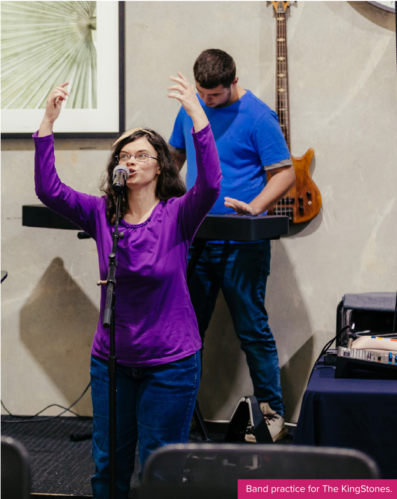
Band practice for The KingStones.