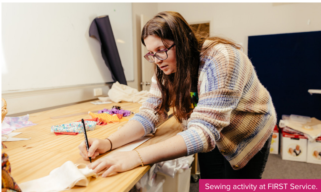
Sewing activity at FIRST Service.