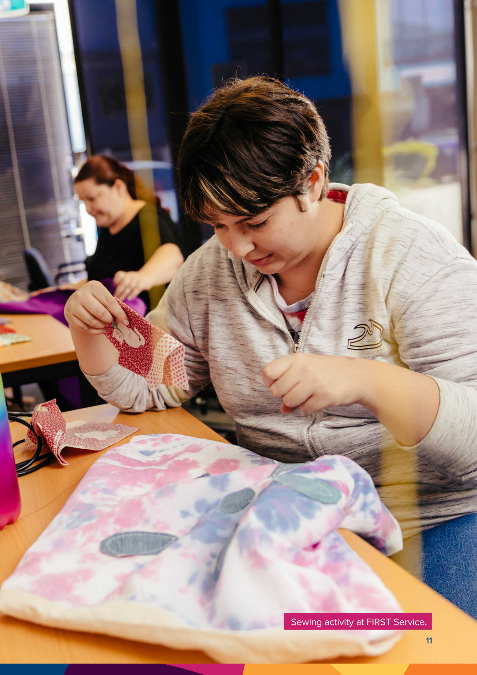
Sewing activity at FIRST Service.