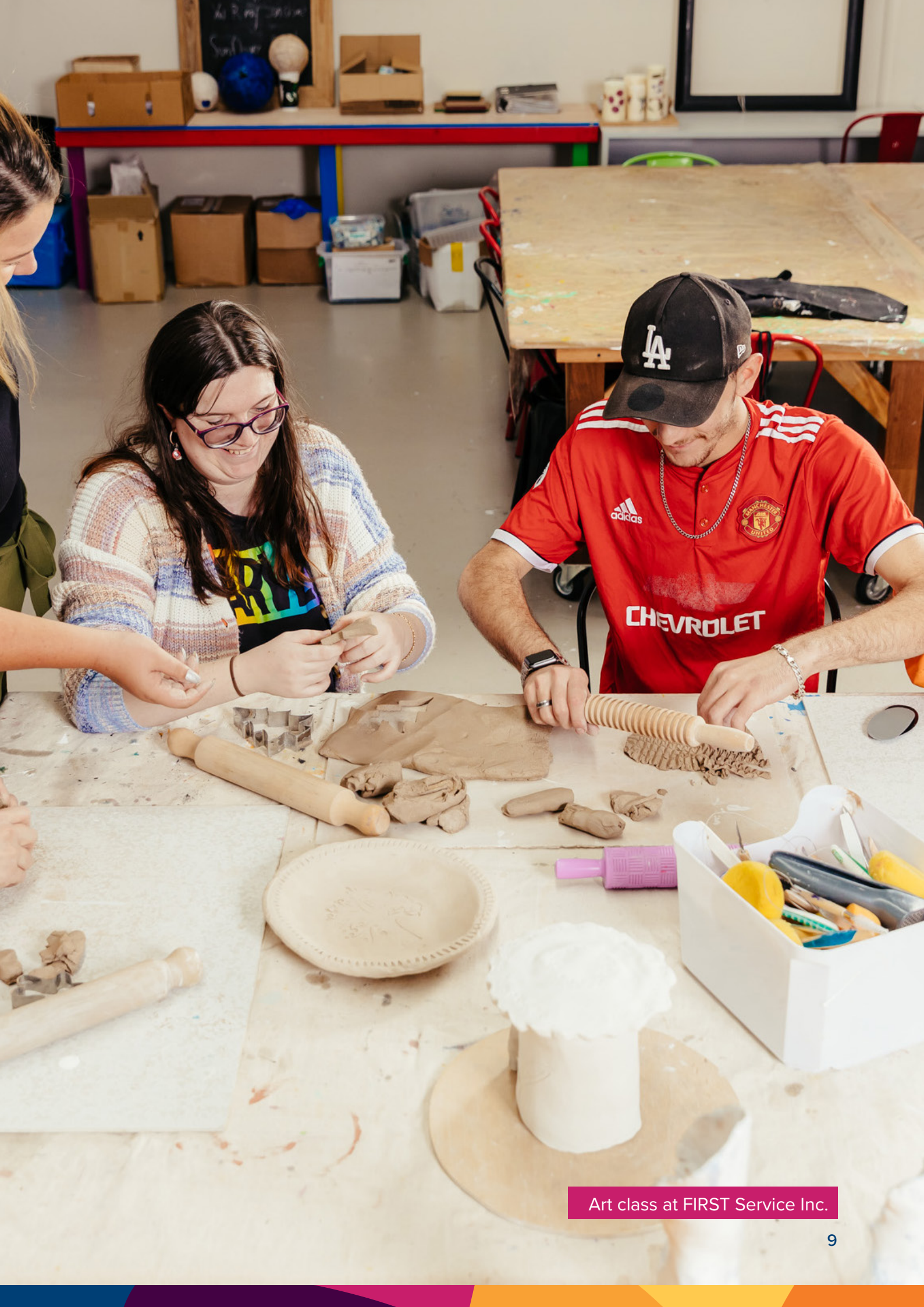
Art class at FIRST Service Inc.