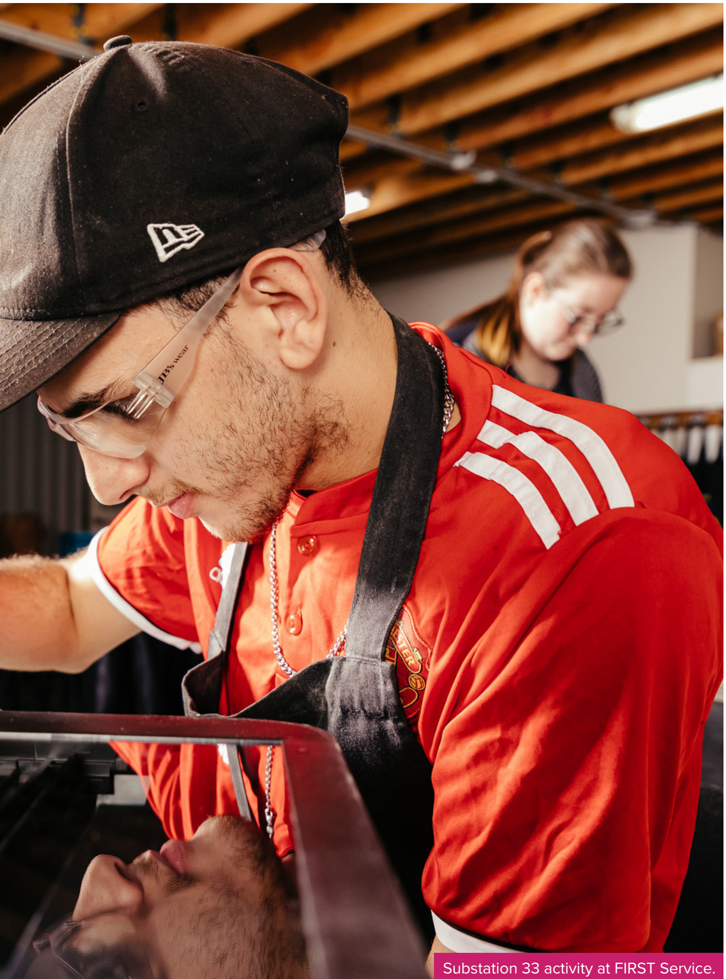
Substation 33 activity at FIRST Service.