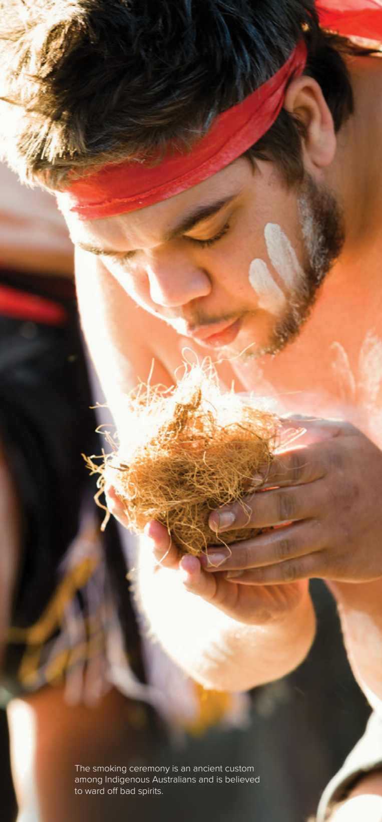
The smoking ceremony is an ancient custom among Indigenous Australians and is believed to ward off bad spirits.