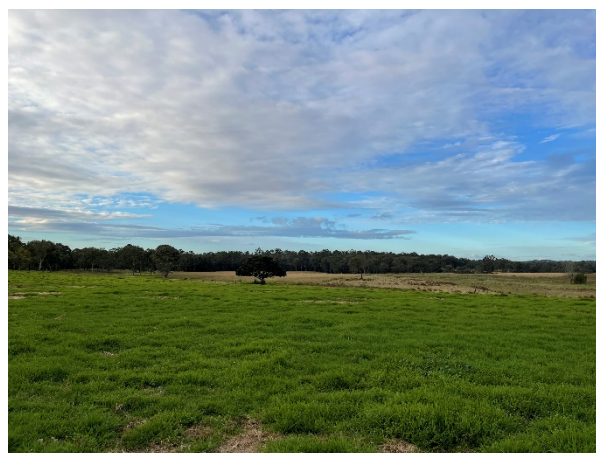
Pleasant View Road site, looking toward the Logan River

Nominations for the Community Reference Group close on 30 September 2021.