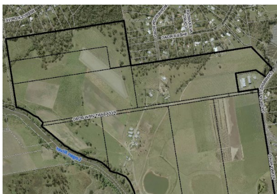
Pleasant View Road site (outlined in black)

Most activities will not cause disruption to surrounding residents. However, there may be some additional truck movements to and from the site via Chambers Flat Road and Pleasant View Road. Ground condition assessments will require the use of an excavator to dig test pits around the site.