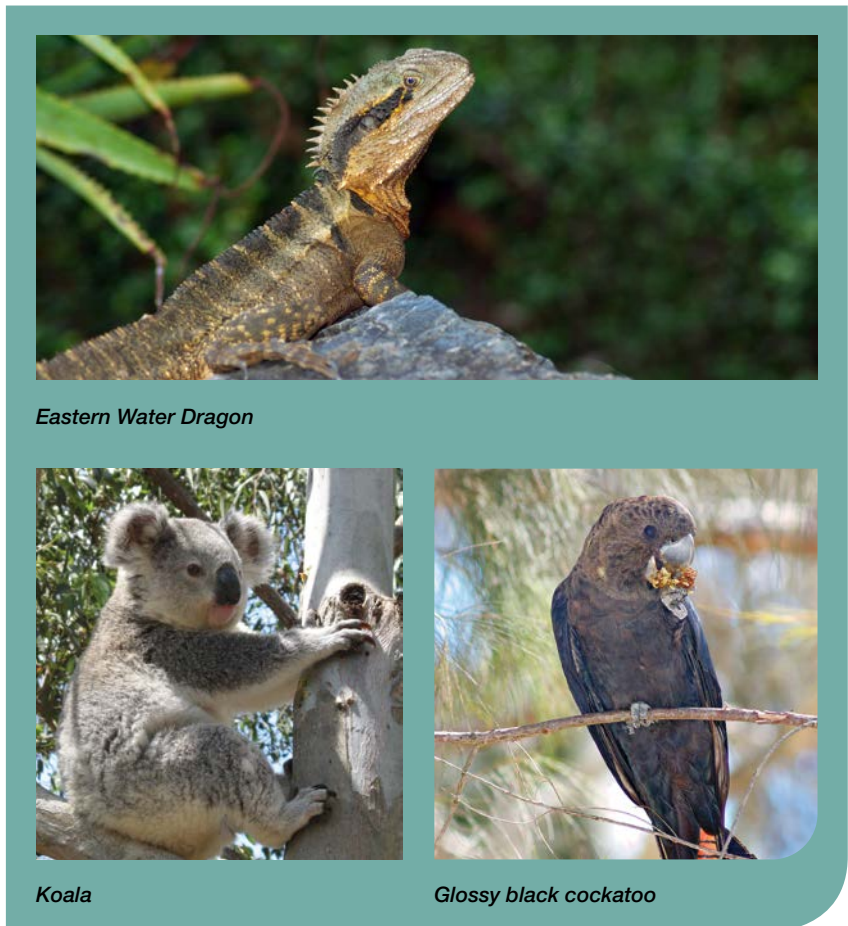
Eastern Water Dragon