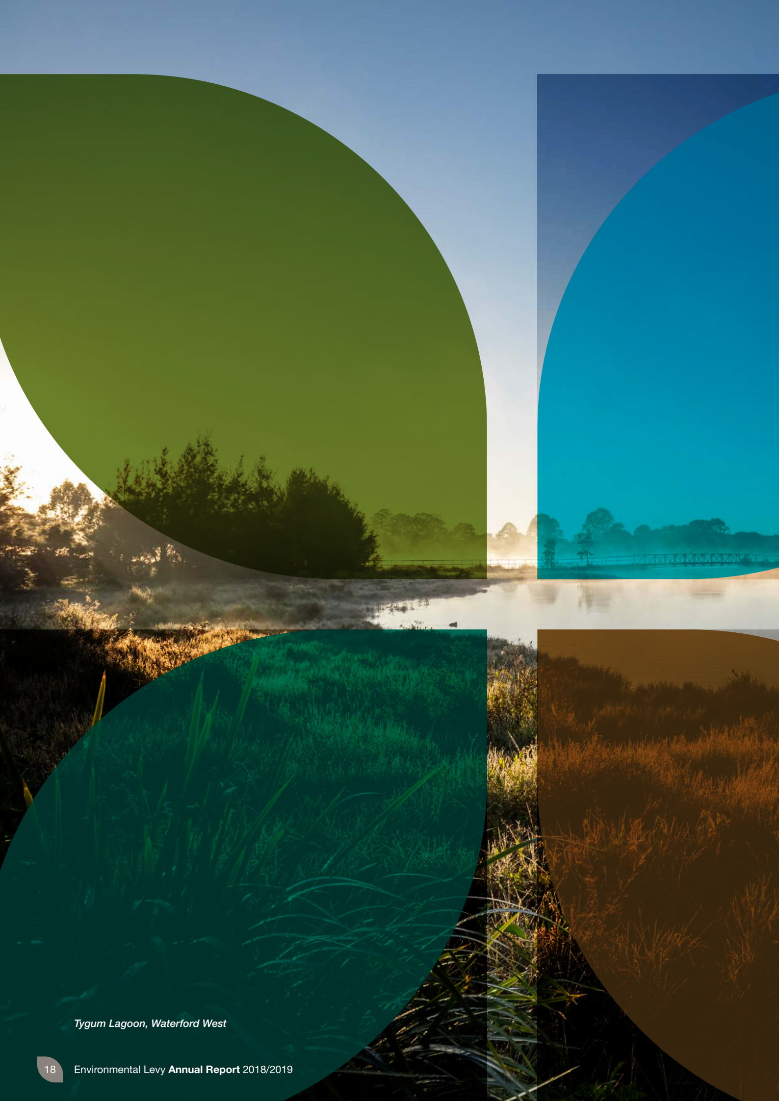
Tygum Lagoon, Waterford West