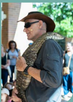
Logan Eco Action Festival (LEAF) 2019