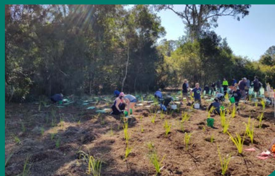
National Tree Planting Day