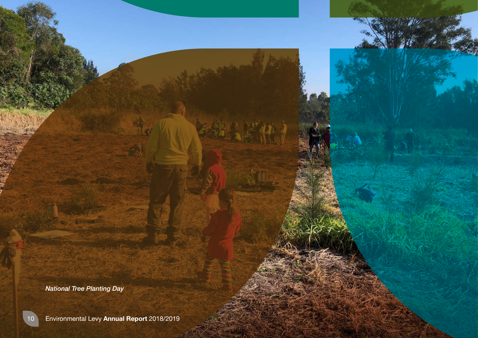
National Tree Planting Day