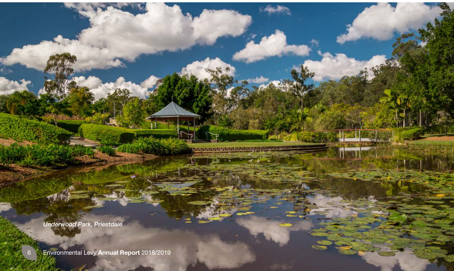
Underwood Park, Priestdale

Environmental Levy funds are allocated to acquire land, fund capital investment and operational costs (including employee costs) to deliver services, projects and initiatives across three key themes.